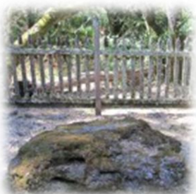
Jack London's Gravesite

The California Writers Club has leveraged Jack London's name for the better part of 100 years. The CWC began as informal gatherings of London and his friends. We cite these stellar origins constantly. Now California State Parks has initiated closure proceedings for Jack London State Park.