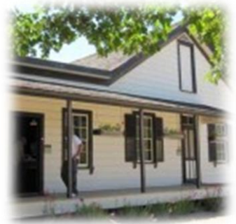
Jack London Cottage & one of the park's view.

Send Donations to Redwood Writers , “for JLP” PO Box 4687, Santa Rosa, CA 95402.