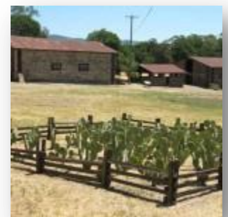
Scene at Jack London State Park